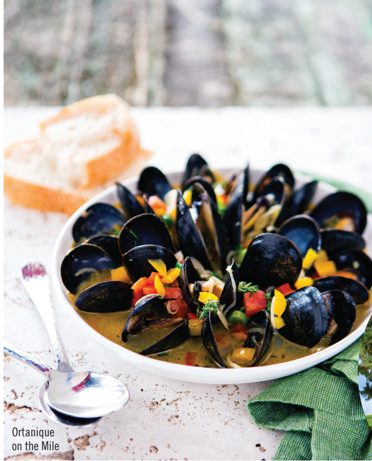
Ortanique on the Mile

“I often find myself wandering through the Special Collections