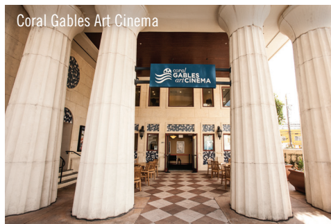
Coral Gables Art Cinema

‘My wife and I love going to the Coral Gables Art Cinema.’