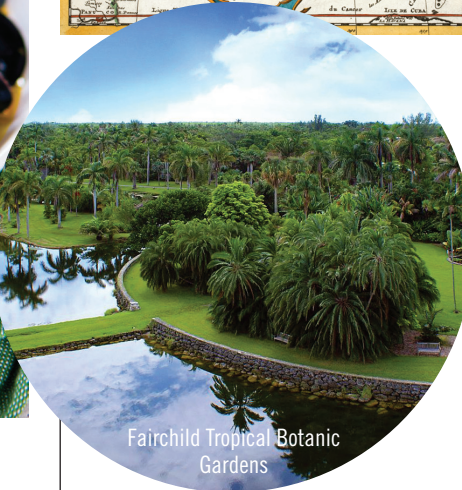
Fairchild Tropical Botanic Gardens