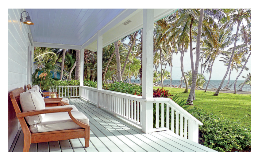
From top to bottom: The industrial-chic lobby of The Perry Hotel, which opened in 2017; a table full of fresh flavors at Matt's Stock Island Kitchen & Bar; a serene porch vista at The Moorings in Islamorada.