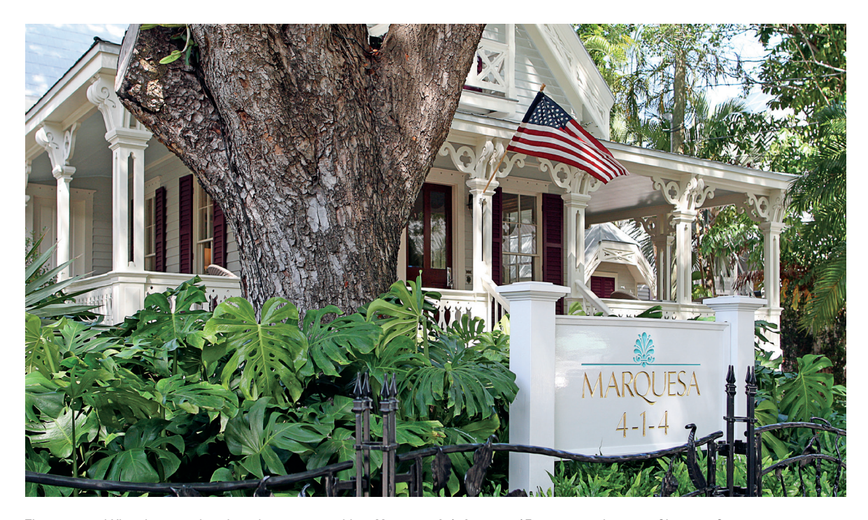
Three restored Victorian mansions have been converted into Marquesa 4-1-4, a new, 17-room guesthouse on Simonton Street that's situated near its sister hotel, Marquesa.

Ease into the beauty of Key West's idyll by checking into the new Marquesa 4-1-4, nestled beneath a riot of green palms on Simonton Street. The 17-room guesthouse opened in October inside three restored Victorian mansions