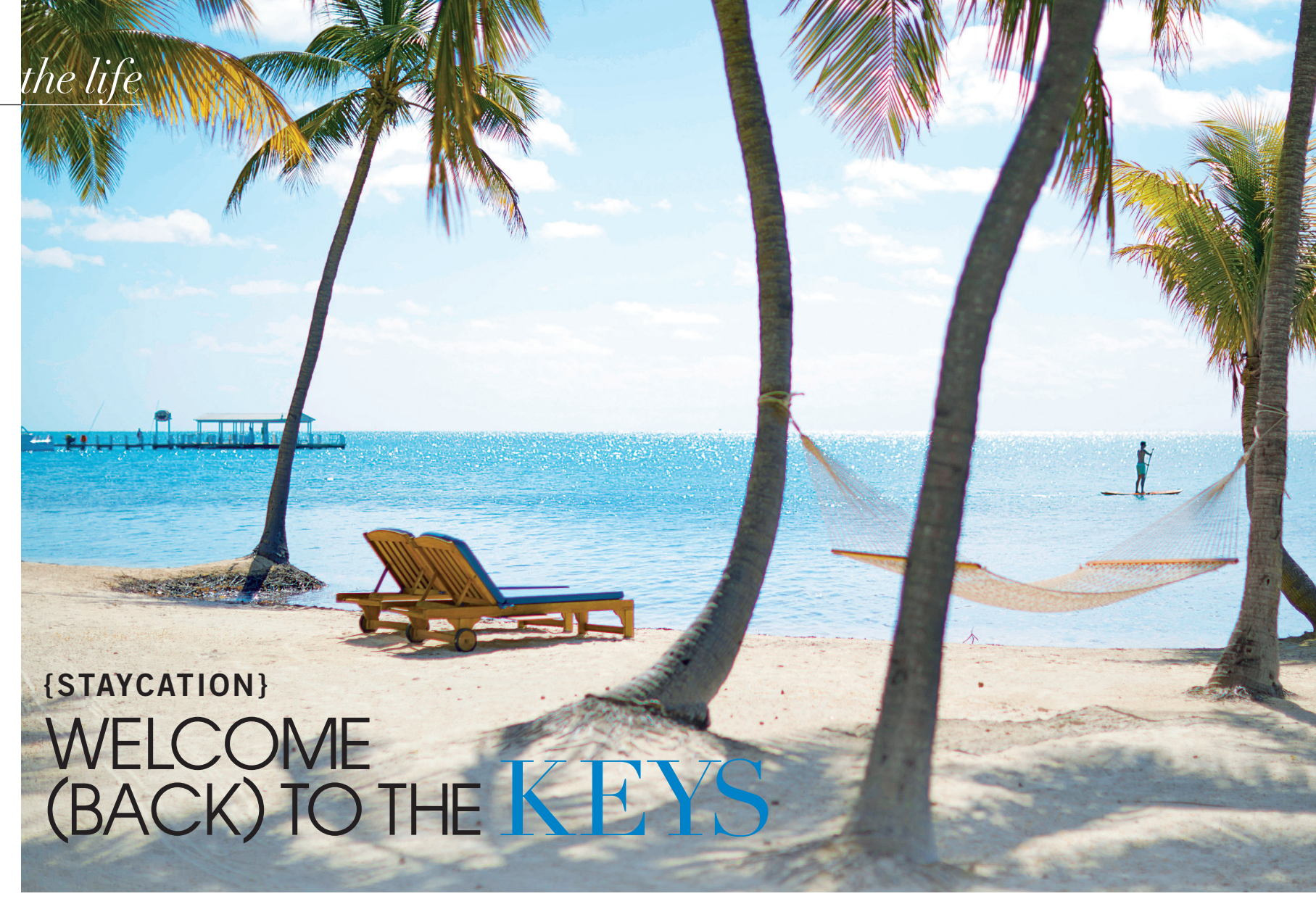
Our beloved Florida Keys are on their feet again after Hurricane Irma. Plot a path through the best of what's new and old from Key Largo to Key West.

here's never been a better time to fall in love with the Florida Keys all over again. Now that the island chain is back on its feet after Hurricane Irma, plan a trip south to soak up the mellow vibes and subtropical scenery that only the Keys can produce. Be prepared for moments of awe and gratitude at the islands' resiliency as you marvel at the sunset or delight in a simple meal of fresh-caught fish. Our INDULGE guide to the best of the Keys, post-Irma: